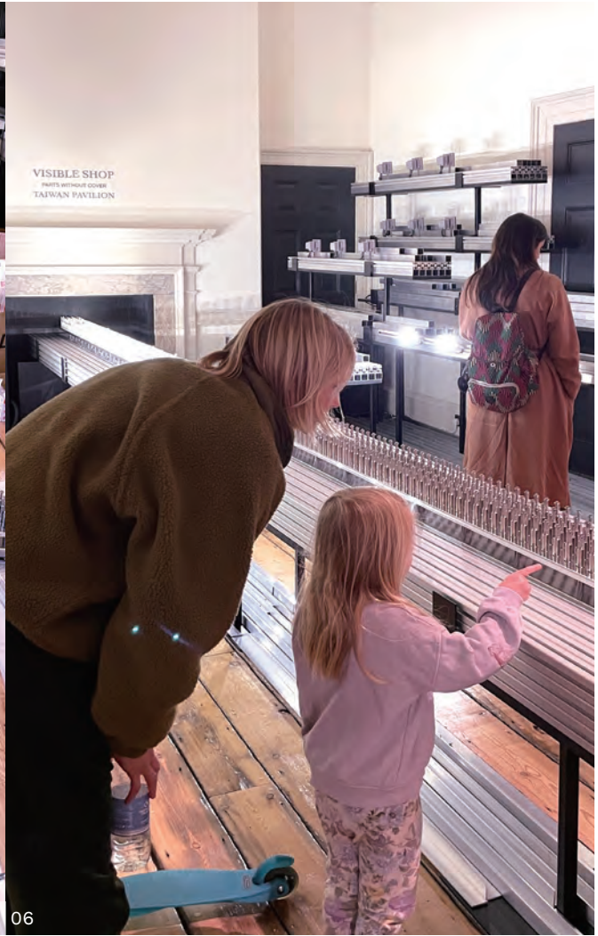
06 民眾仔細觀賞作品 Visitors looking at the exhibit.