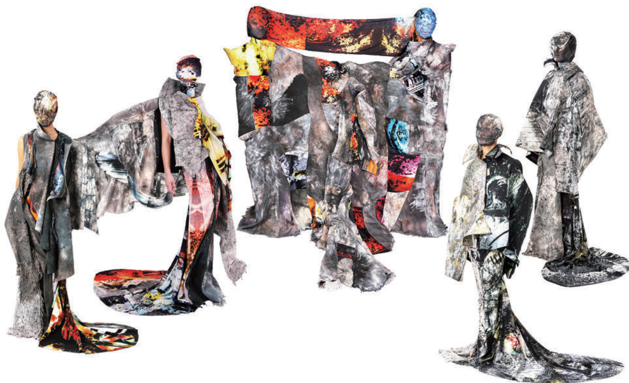
01 人消逝的過程，衣服原來是人穿，漸漸地轉換到布料之間，變成布穿人。 In the process of people disappearing, clothes were originally worn by people, and gradually changed to the clothes wearing people.