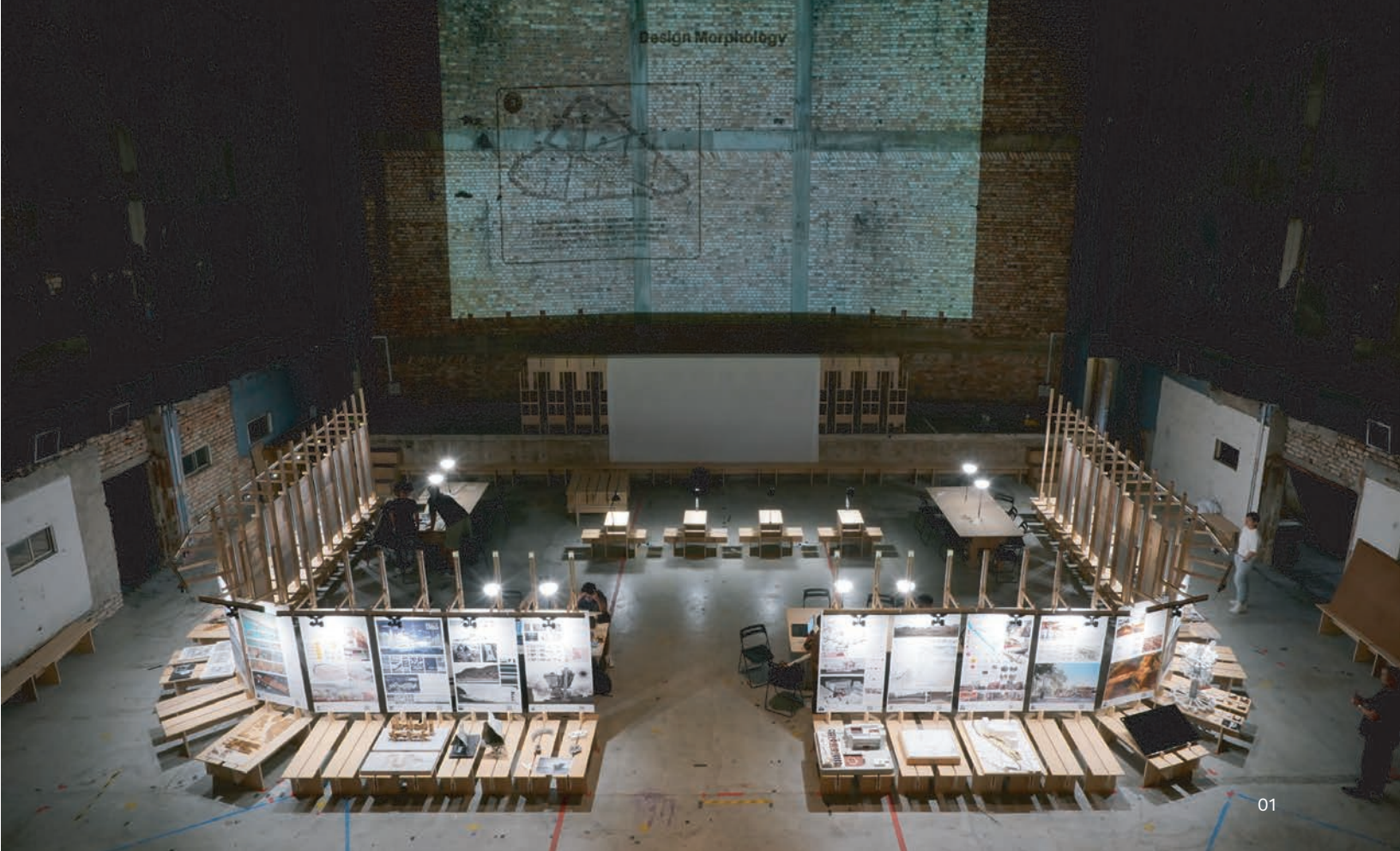
01 展覽全景 Exhibition Overview