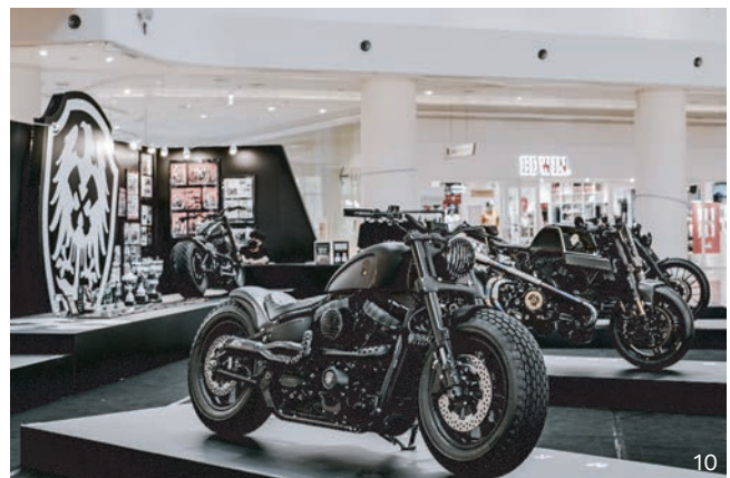
10 展覽現場 11 Exhibition photos

“ Black ” is a popular color. However, black has many different tones and shades. The minute differences create more depth and richness for this seemingly monotone color. Leveraging more than two decades of experience in bike modification, Yeh has been able to design more freely and meet the needs of those clients who love black. ■