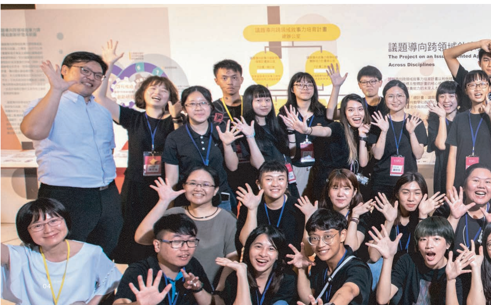
04 未來議苗成果展工作團隊合影 “A Discussion for Future” team