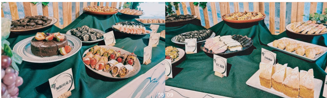
09 皮埃蒙特之巡禮 - 蛋糕與餅乾 Cakes and cookies