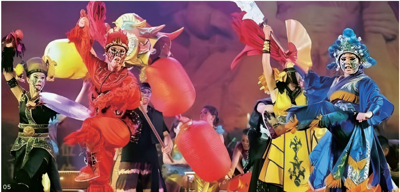
05 學生於高雄內門場域示範宋江陣 Students performed the Song Jiang Battle Ritual in Kaohsiung's Neimen District.

University, Chung Yuan Christian University, National Taiwan University of Science and Technology, Chihlee University of Technology, Asia Eastern University of Science and Technology and Shih Chien University. In addition to the tasks mentioned, regional centers regularly send teams to visit participating universities and address the questions raised by the universities.